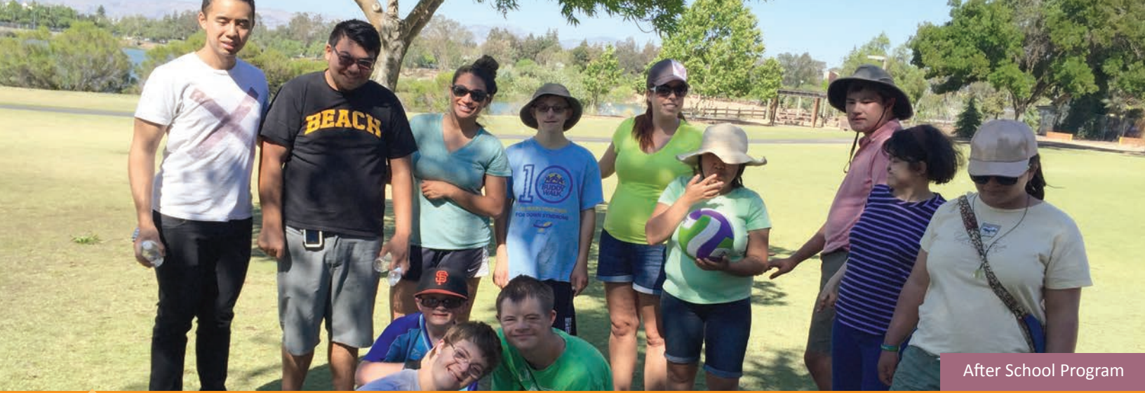
After School Program