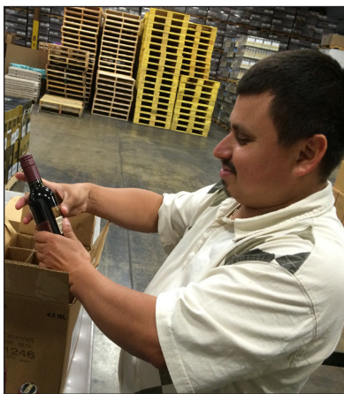
Hope has worked with J.Lohr for 10 years packaging and shipping wine all over the world.

Hope celebrated its 10th anniversary working with J.Lohr Vineyards and Wine. J. Lohr, one of the most established wineries on the Central Coast hires Hope participants to label bottles and ship wine all over the world.