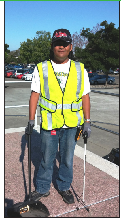
Participants maintain grounds at Tesla