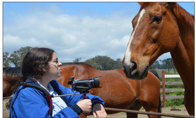
EMCC will offer training in technology, including video production.

Hope is excited to announce the grand opening of the Employment, Media and Community Connections program on August 12th at the Parkmoor facility. Parkmoor underwent a renovation which includes smaller classrooms complete with computer workstations, a video production room, and furniture. The EMCC service will align with Hope’s mission by providing exciting opportunities for partici-