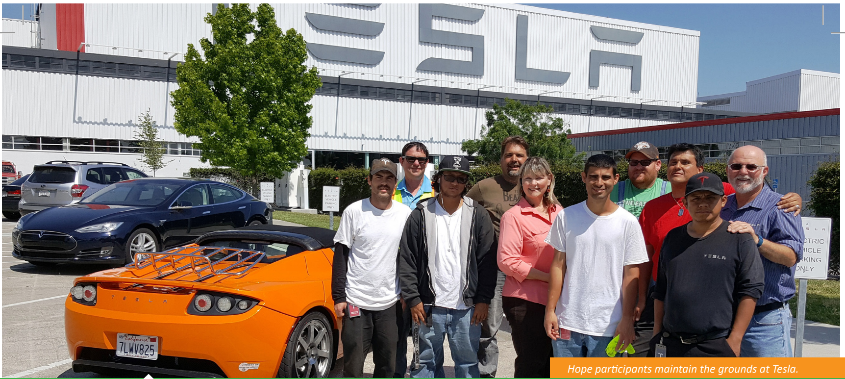
Hope participants maintain the grounds at Tesla.