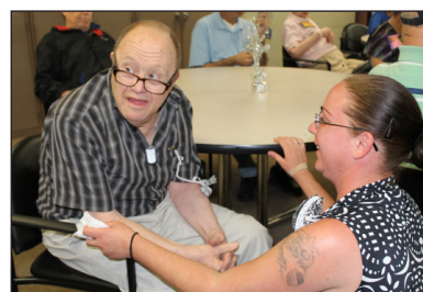
Seniors received certificates followed by dancing and refreshments.

Parkmoor’s Senior Center celebrated the graduation of the class of 2016. Certificates were handed out in a formal graduation ceremony. After the ceremony, Hope’s seniors enjoyed a prom party complete with snacks, friends and fun.