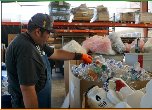
Hope participants manage recycling program at Agilent.