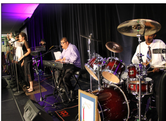
The New Hope Band performed at the Lanterman Celebration

On Monday afternoons at the Parkmoor facility, The New Hope Band (formerly known as the Magic Makers) can be heard rehearsing the latest popular hits.