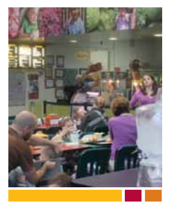
The Kid's Café at the Children's Discovery Museum.

HOPE Services has always been a leader in the disabilities field. It is often recognized for its innovations that provide opportunities for participants to become active and participating members of their community. The 90's at HOPE Services saw many new initiatives with the launch of HOPE-owned and operated businesses and the Supported Living Program.