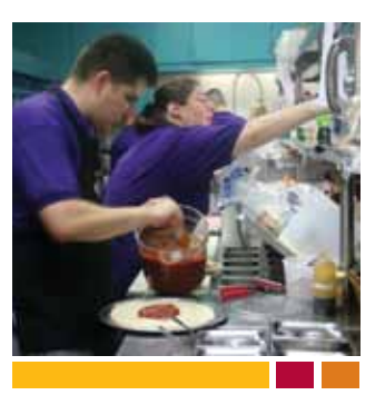
Job training at the Kid's Café.

For the last 22 years, the Kids Café has provided opportunities for HOPE paricipants to receive job training. Many have gone on to become regular employees in the food service industry, while others have gone on to enjoy employment in a variety of other customer service businesses.