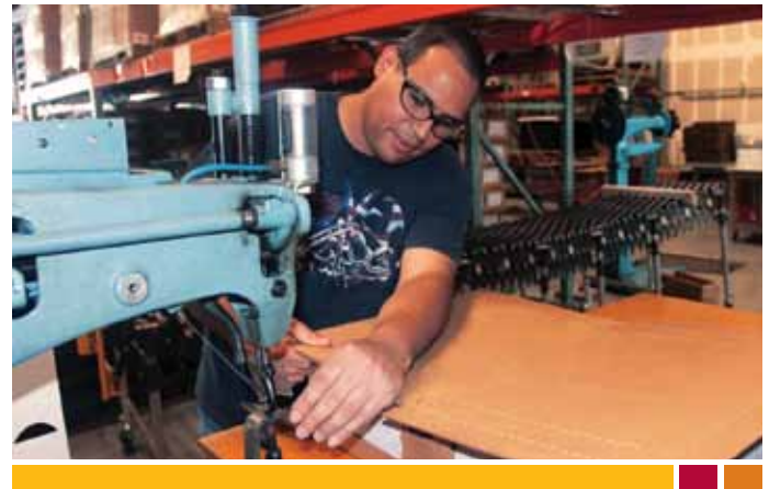
HOPE has over 400 participants in jobs in the community.